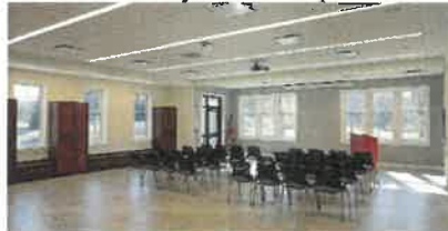
Conceptual Design for Community Room Expansion

Simply put, the building no longer supports the Library's mission of serving the community.