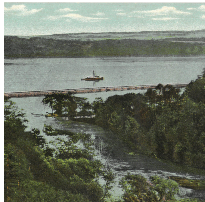
The Hudson at MARLBORO, N. Y.