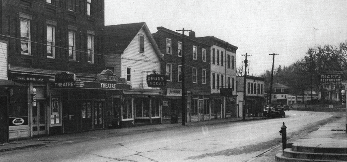
"Main Street, Marlboro N.Y." postcard, no date. (circa 1940s or 50s)