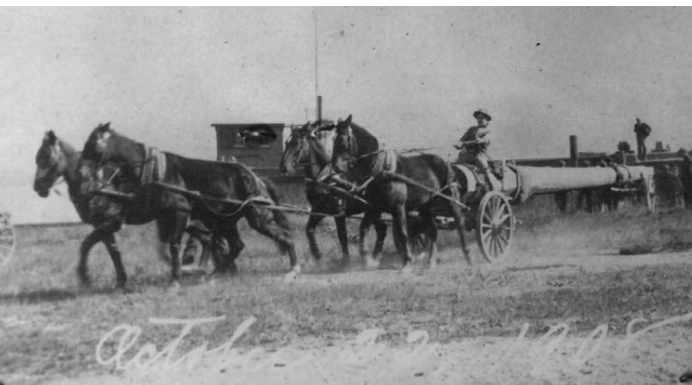
Marlboro flagpole being hauled from the dock on October 22, 1908.